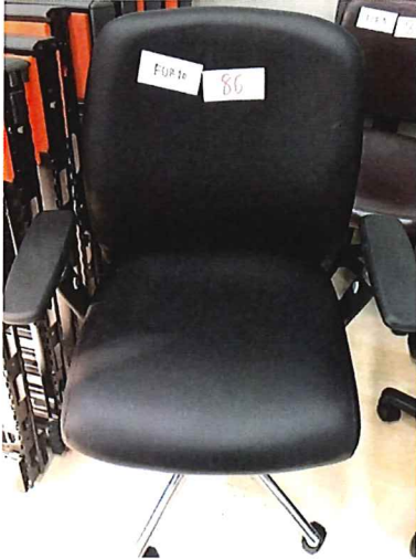
1 unit of movable chair