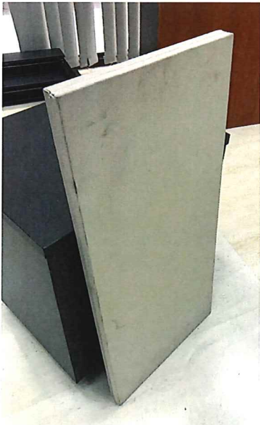
12 units of partition plate size 80 x 60 cm