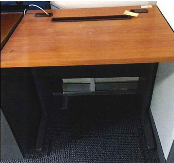
2 units of table for printer