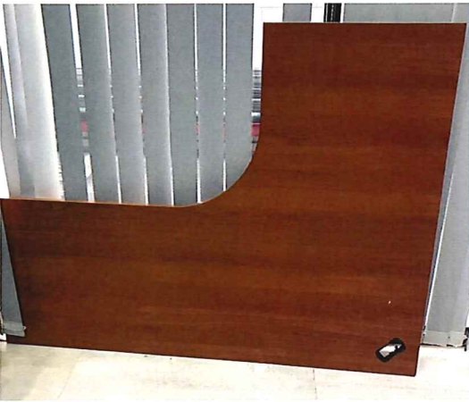
1 unit of table top 106 x 120 cm