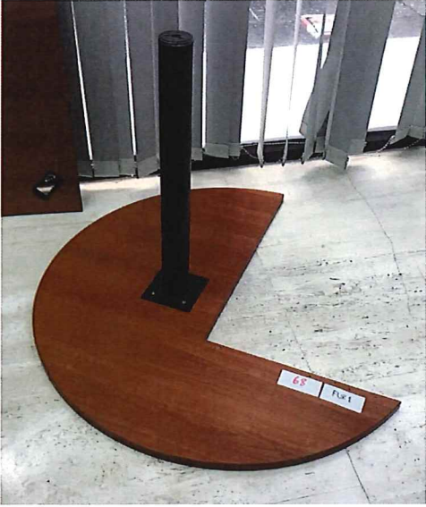
1 unit of half round shape table