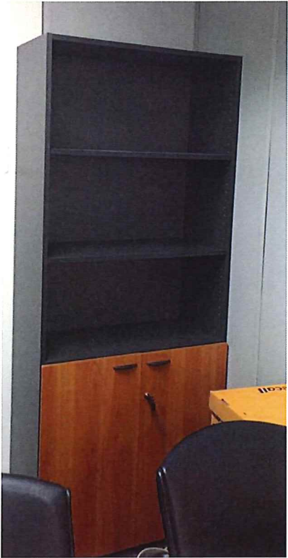
2 units of high cabinet without glass door