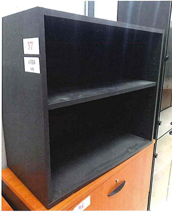
1 unit of two-layer cabinet