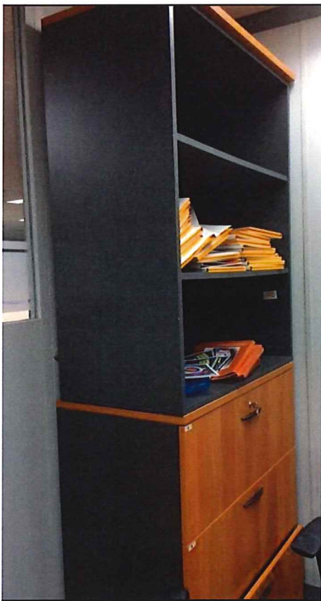
2 sets of extra tall cabinet