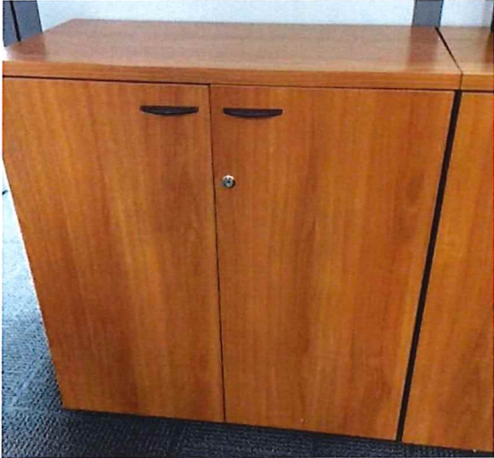
6 units of low cabinet