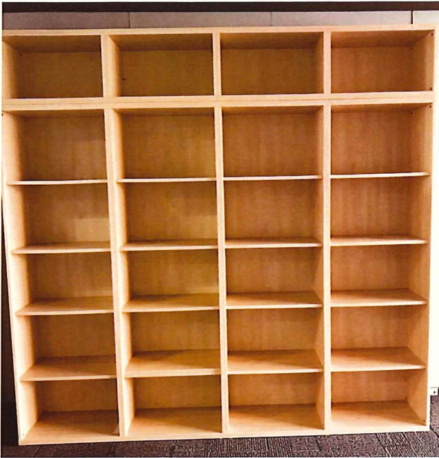
2 units of giant cabinet