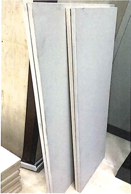
2 units of partition plate size 130 x 60 cm 2 units of partition plate size 130 x 40 cm