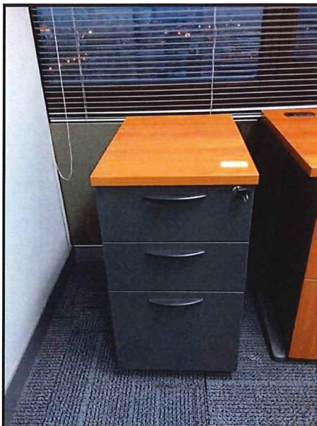
6 units of three drawers mobile cabinet with top