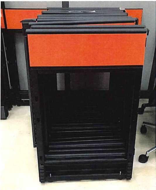
10 units of partition frame, size 60 x 60 cm