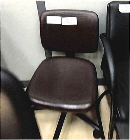
1 unit of movable chair