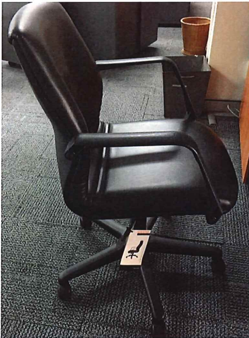
2 unit of chair (movable)