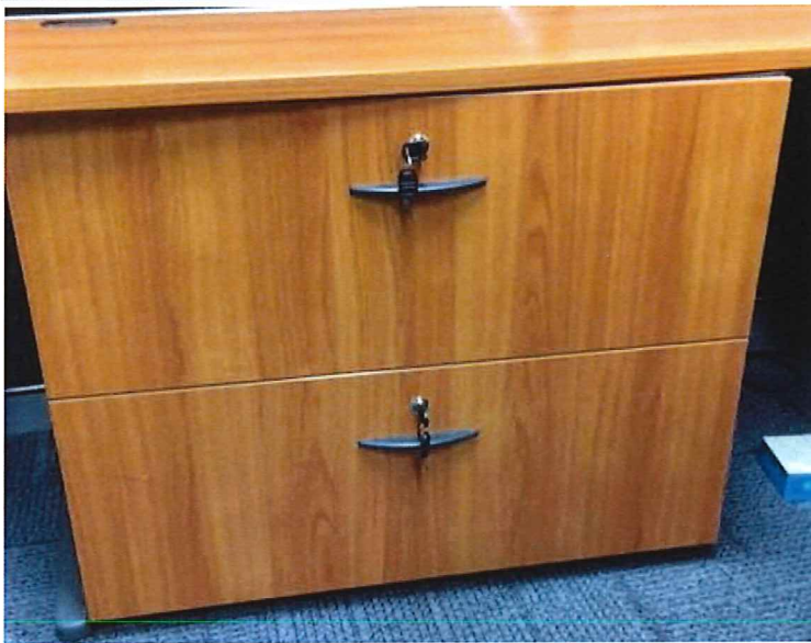
8 units of hanging files cabinet