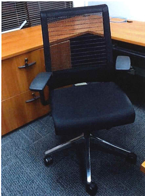
9 units of office chairs