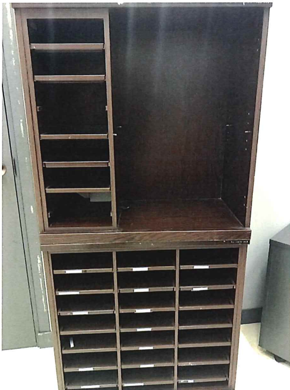
1 unit of letter sorting cabinet