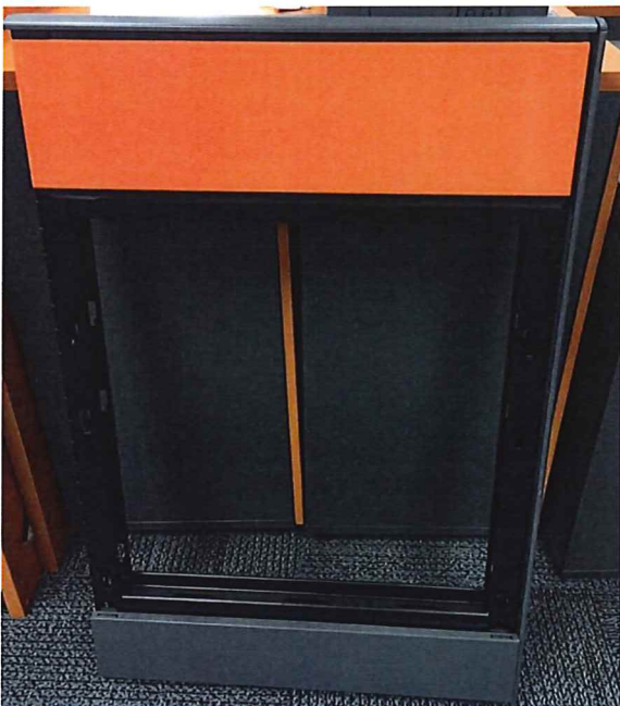
4 units of Low Partition frame size 60 x 90 cm