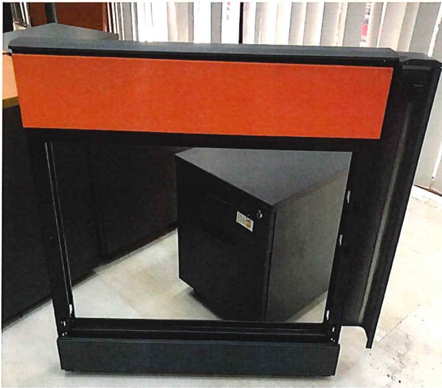
1 unit of frame size 80 x 90 cm