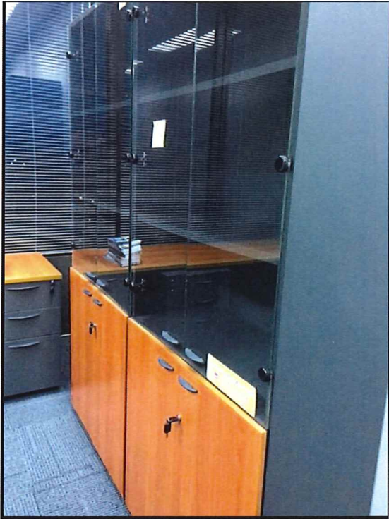
25 units of tall cabinet