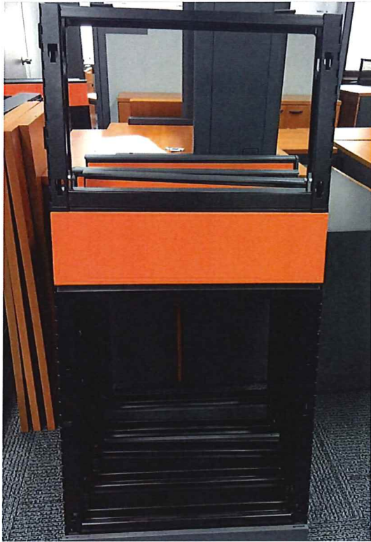
3 units of partition frame size 60 x 130 cm