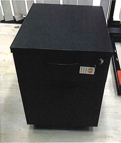
1 unit of mobile cabinet without top