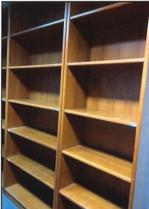
3 units of giant cabinet