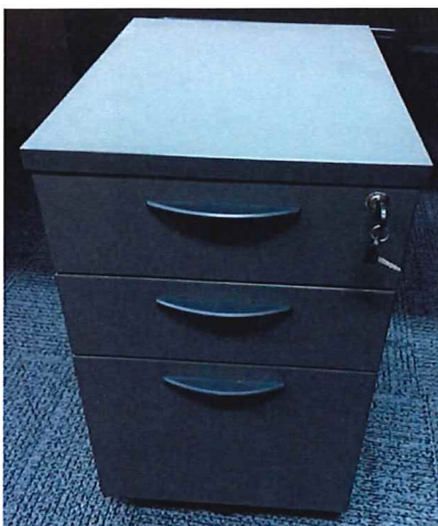
9 units of mobile cabinet without top