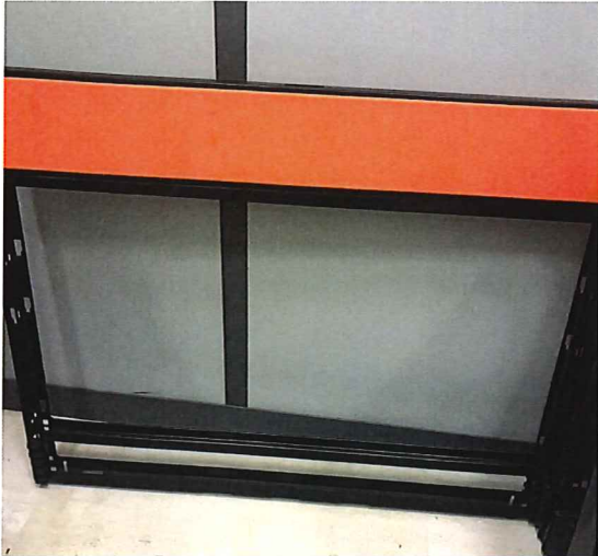
1 unit of partition frame size 130 x 90 cm