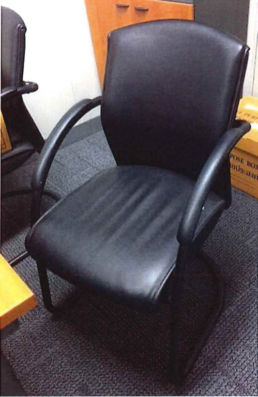
15 units of visitor chair