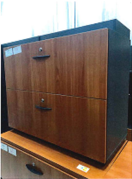
1 unit of two layer hanging file without top