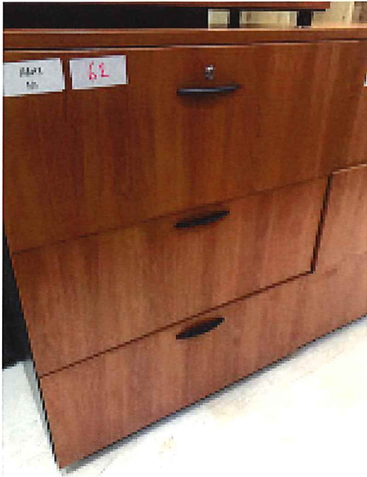
3 units of three layer hanging file with top