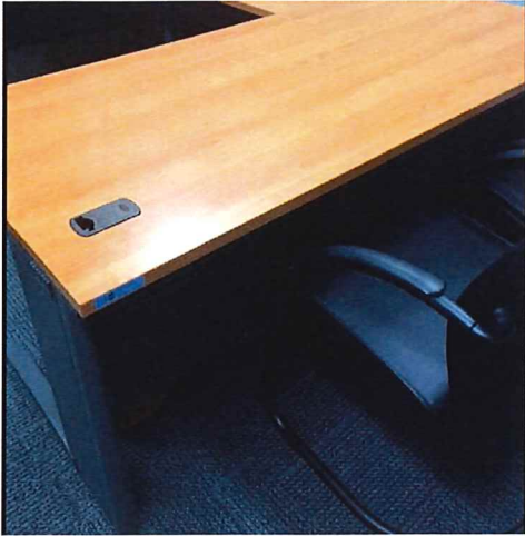
5 units of main table