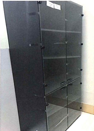
4 units of high cabinet with glass door