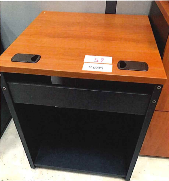
1 unit of computer desk