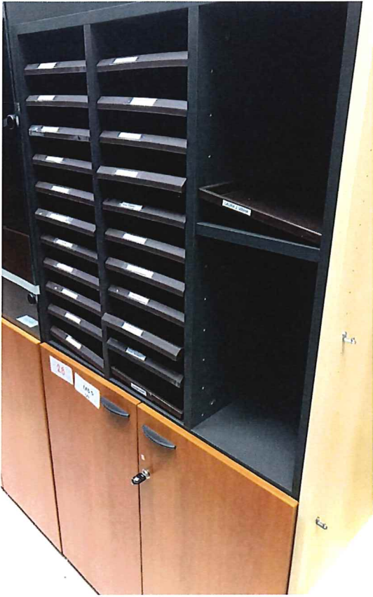
1 unit of letter sorting cabinet