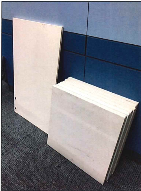
21 units of partition plate size 60 x 60 cm 12 units of partition plate size 60 x 100 cm