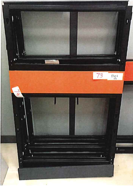
3 units of partition frame, size 80 x 130 cm