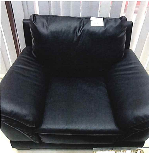
1 unit of one seat sofa