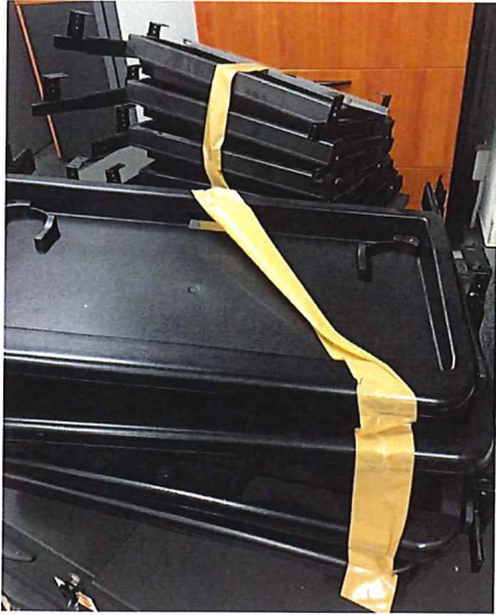
10 units of key board tray