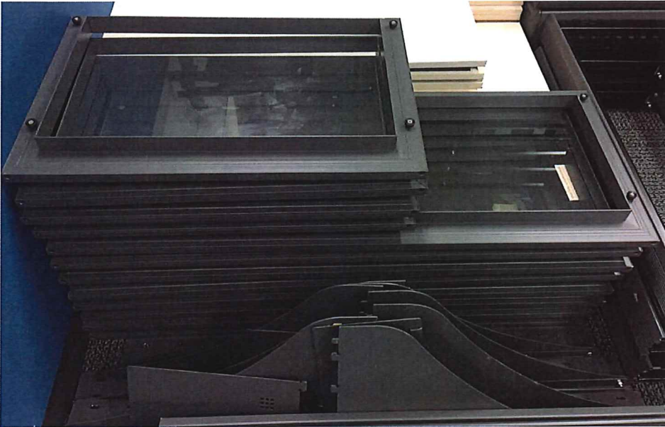
4 units of Glass panel 60 cm