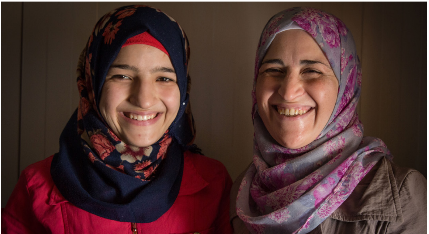
Mother and daughter in Zaatari, Jordan