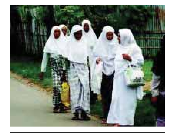
UNFPA-supported Puspita women's crisis center for survivors of GBV located in a pesantren (Islamic boarding school) complex.