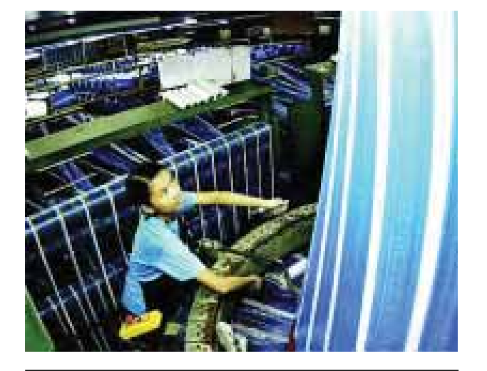
Women economic empowerment to reduce their vulnerability to GBV

Legislation against GBV must first define what behaviours and actions constitute a crime, followed by appropriate punishment and perceived deterrents. Many of the laws, at first glance, appear to protect women against GBV (e.g. Malaysia's Domestic Violence Act; Thailand's Act on Prevention and Control of Trafficking and Article on Control of Sexual Business; Cambodia's Law on the Prevention of Domestic Violence and the Protection of Victims, and Viet Nam's