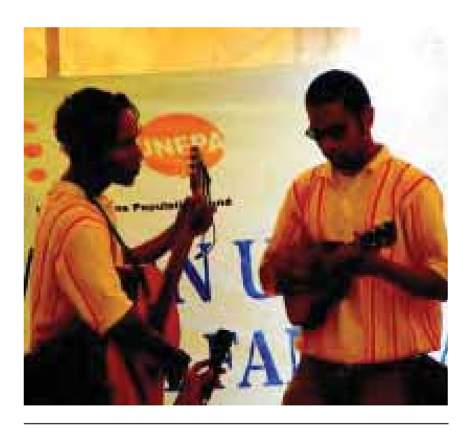
UNFPA supported awareness-raising activities on prevention of GBV among internally-displaced people in Timor-Leste