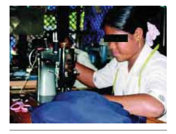
GBV survivor acquiring sewing skills at the Cambodian Women's Crisis Centre

Some are given Ministerial status as in Mongolia (Ministry of Social Welfare and Labour and the National Committee on Gender Equality headed by the Prime Minister) and Cambodia (Ministry of Women's Affairs) or Departmental status within Ministries. In Malaysia the Department of Women's Development is the implementing agent for women's development while the Department of Social Welfare is tasked with implementing the DVA (Domestic Violence Act). But both agents are located within the Ministry of Women, Family and Community Development, which is technically entrusted to make the decisions and policies. Indonesia has established a specific GBV support institution known as the National Commission for Elimination