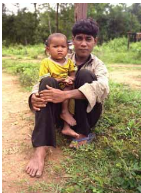
A father and child attend a maternal nutrition discussion held by a Pharmaciens Sans Frontières (PSF) health education team at a remote village in Stung Treng province, Cambodia.

Policy documents in Cambodia use the term “indigenous peoples” to define ethnic minority groups residing in mountainous hilly areas. The Department for Ethnic Minorities in the Ministry for Rural Development also defines ethnic minorities as “groups who live in a community, from a specific location and have lived in the same area for many years”. In other documents, “migrants” include minorities such