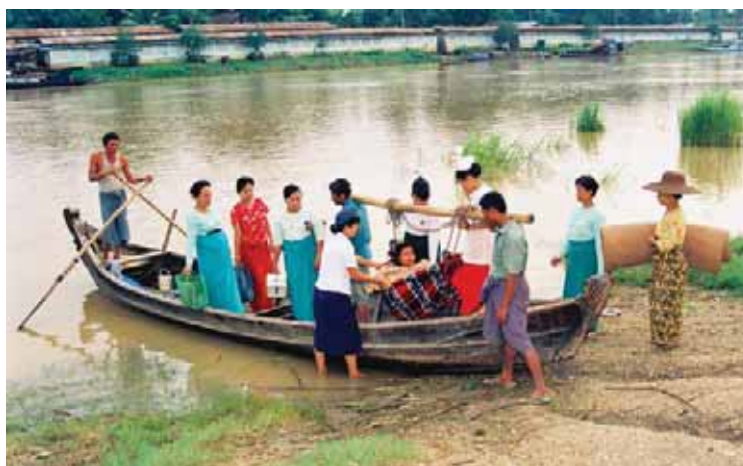
The Red Cross and other NGO members in Myanmar help a pregnant woman receive the care she needs.

Myanmar has numerous ethnic groups, located mainly along the border areas of the country. Some studies suggest that Myanmar has over 135 different ethnic groups, while others suggest 67 separate ethnic groups with different languages, dialects, customs and traditions. The main languages spoken are Arakanese, Burmese, Chin, Kachin, Karen, Karenni, Mon, Sha, Wa, English and minority dialects. The 1948 constitution gave each nationality (i.e., population