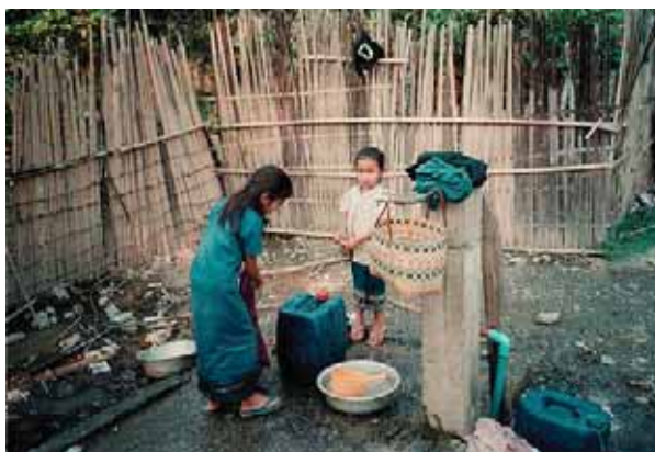
A Hmong ethnic village in Vientiane Province, Lao PDR. These Hmong children collect water for their family after leaving their village primary school. This one water tap - the village's only source of drinking water - is used by 400 people.

The 1995 Population Census recorded 47 different ethnic groups in Lao PDR. The Lao are the largest group constituting 52.5 per cent of the total population and live mostly in the low land areas of the country. Other sources suggest that