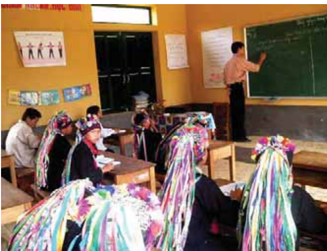
Children of the H'Mong Dao ethnic minority group attend class in an education center in Ho Thau, Tam Duong District, Lai Chau Province, Viet Nam.

A large proportion of ethnic minority communities in the GMS primarily function in a language other than the national language. Children from such communities have difficulty succeeding in schools that use programmes using a language that is different from their mother tongue. Adults are also constrained by the need to use the “foreign” language in everyday life to communicate with outsiders. People from ethnic minorities in Cambodia have, for example, difficulty operating in local markets using the Khmer language. 21