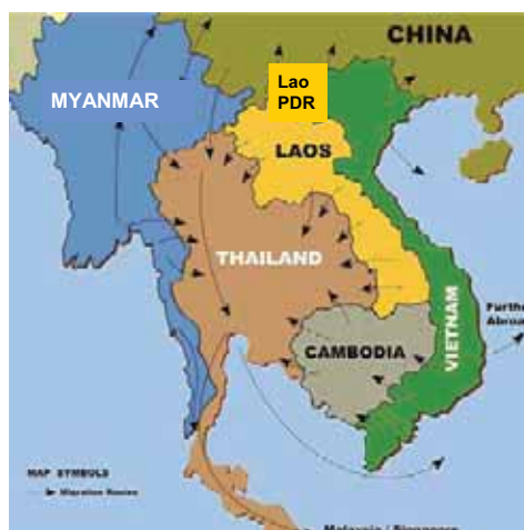
Figure: 1 Migration patterns in the Greater Mekong Sub-region 13

The boundaries and names shown and the designations used on this map do not imply official endorsement or acceptance by the United Nations.